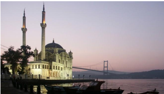
Ortakoy Mosque at sunset, Istanbul

Istanbul can look back to two millennia of extraordinary history as the capital of three successive empires: East Roman , Byzantine and Imperial Ottoman , leaving their signs all over the city and giving it its unique character. Iconic landmarks such as the Galata Tower and the Blue Mosque , countless minarets, scattered gracefully over the seven hills, as well as two massive suspension bridges – among the largest in the world – add to a picturesque skyline .