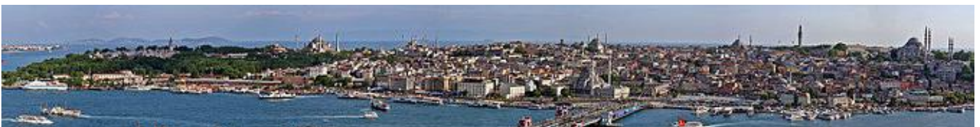
Panoramic view of the Golden Horn as seen from the Galata Tower, Istanbul