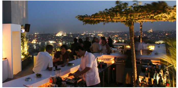
Mikla rooftop restaurant & bar, Istanbul

For a bird's eye view of the metropolis, the city's smart staple is the multiple award-winning 360 , a glass-walled rooftop restaurant in a turn-of-the-century apartment house, offering an interesting mix of Asian and European cuisine with a popular bar.