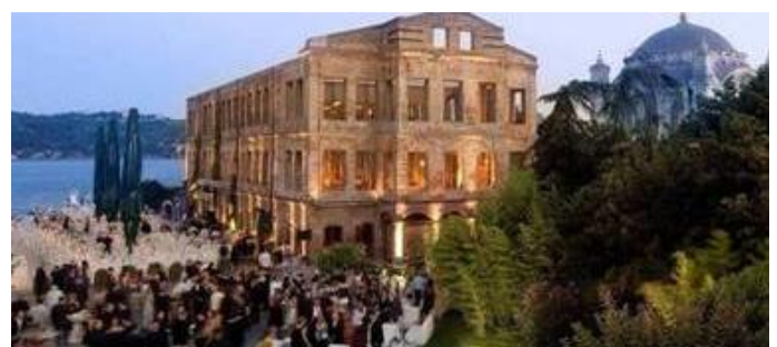
Esma Sultan Mansion, Istanbul

Back to the past: Istanbul inherited some rich “pickings” from its Ottoman ancestry as for palaces and mansions, and many have been restored and converted into boutique hotels, clubs and restaurants. Matbah , in the heart of the Old City , is one of them. It offers authentic Ottoman cuisine in the opulent surroundings of a palace garden and caters for small and medium-sized parties. As an option for larger groups, you could host a gala reception and dinner at the scenic Esma Sultan Palace , a glass covered brick ruin that can be used as a year-round venue for events and exhibitions.