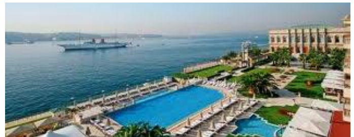
Çırağan Palace Kempinski, Istanbul

Four Seasons Bosphorus: www.fourseasons.com 5-star luxury property on the European bank of the Strait , radiating a fresh, eclectic spirit. 170 bright and airy guest rooms, blending Ottoman design details and contemporary furnishings with garden, city and waterfront views. Features 2 elegant ballrooms with pre-function areas and 6 tastefully decorated meeting rooms, enhanced by sophisticated quayside terraces.