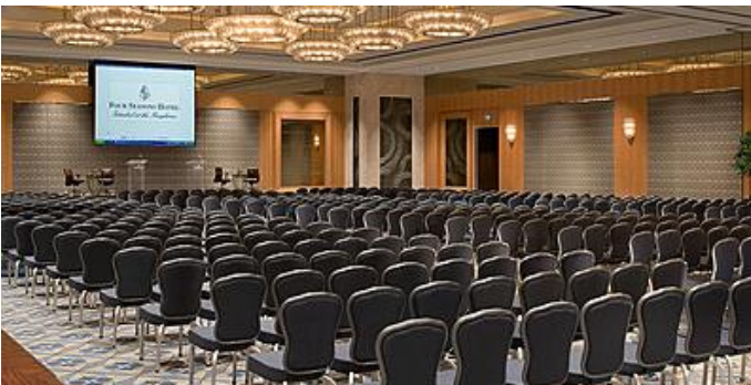
Grand Ballroom, Four Seasons Bosphorus, Istanbul

Hotels are everywhere throughout the city: in the Conference Valley , the Business & Financial District , the Historic Peninsula and near the Airport & Exhibition District . However, to avoid the notorious Istanbul traffic jams, we recommend hotels either within walking distance from major attractions and venues or located close to the sea to be able to use (private) boats, undoubtedly a quicker way to get to some areas .