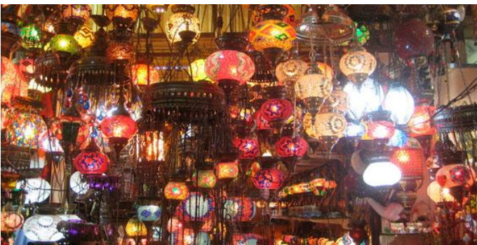
Lanterns, Grand Bazaar, Istanbul

And don’t leave Istanbul without buying a box of Turkish delight , an edible, sweet souvenir consisting of sugar-dusted cubes of thickened milk, fruit or dried nuts.