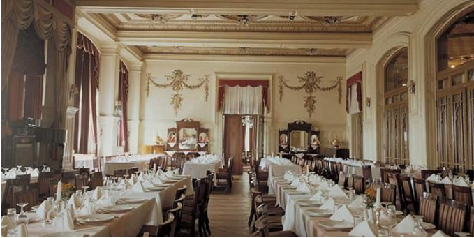
Ballroom, Pera Palace Hotel, Istanbul

5-star deluxe “museum-hotel” established in 1892 to serve Orient Express clientele. In 2010, it re-emerged, restored in full grandeur after 3 years of renovation. Overlooking the Golden Horn and amidst the Taksim District , a center of cultural activities and night life, it features 115 beautifully appointed rooms, recreating the atmosphere of late 19 th century Istanbul.