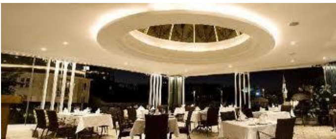
Winter garden, Matbah Restaurant, Istanbul