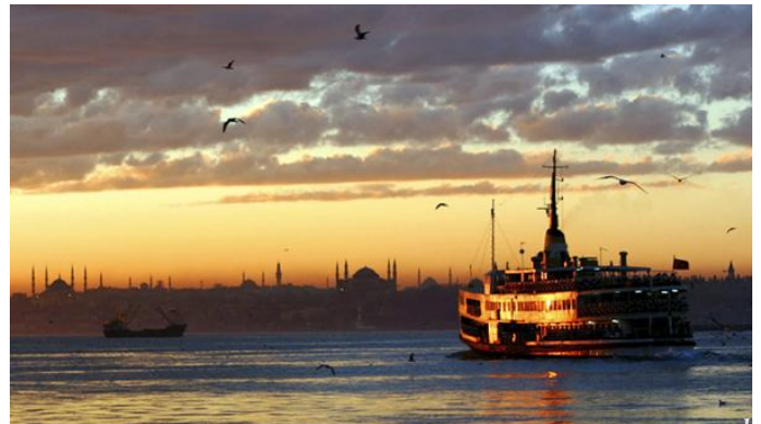
Sunset cruise on the Bosphorus, Istanbul

After sightseeing and shopping, spoil your guests with some authentic Turkish fare , including delicious mezes , classic kebabs - of which there are over 100 varieties – and phyllo-pastry with honey and chopped nuts in the form of baklava for dessert. Freshly brewed Turkish coffee and Turkey’s national drink raki , an anise-flavored spirit that turns milky-white when mixed with chilled water, round off the culinary expedition in the Land of the Crescent Moon . Afjet olsun and serefe!